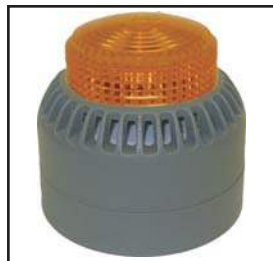
OPTIONAL PRE-ANNOUNCE TO CLOSE KIT Available with light, alarm or combo.