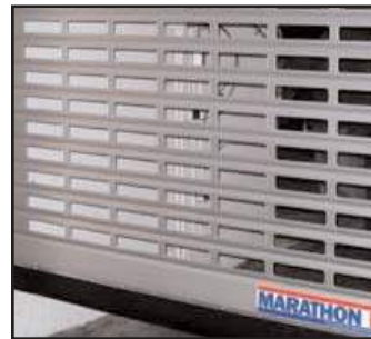
FENESTRATED ANODIZED ALUMINUM SLATS Provide security while maintaining air flow.