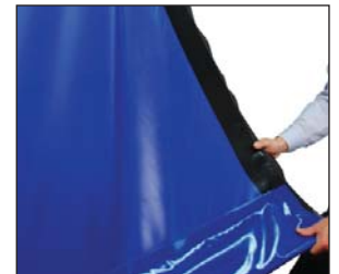
Breakaway with Auto Reset