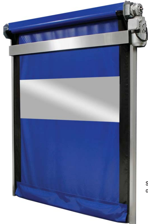
Shown with optional side covers and full vision panel.

Innovative Design. Superior Performance. Exceptional Value.