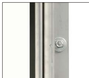
Ultra Low Profile