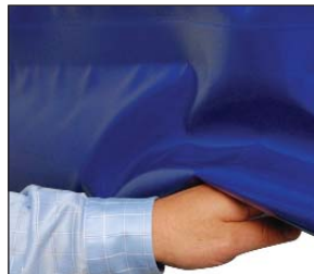
Wireless, Soft Bottom Edge