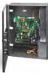
115 VAC Standard Control Box