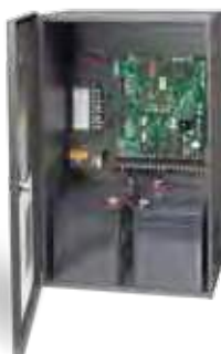
Solar Control Box Dual Gates