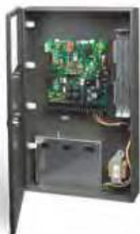
115 VAC Deluxe Control Box