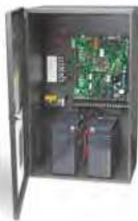
Solar Control Box Single Gate