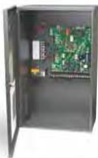
Solar Control Box Basic