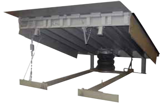
CentraAir™ Series 6'x 8' 35,000 CIR with toe guards lifted shown.

For over 50 years and beyond, throughout various industries, Poweramp dock equipment continues to exceed all material handling industry standards.