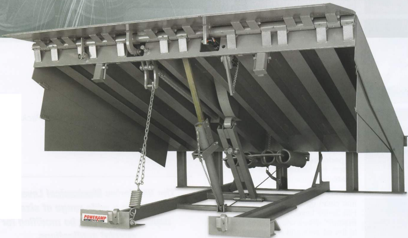
HM Series 7'x 8' 50,000 CIR, Full Range Toe Guard and CleanSweep Frame™ shown.