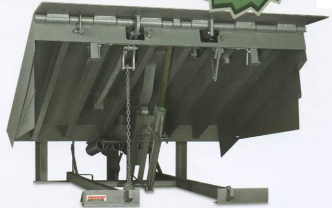
HM Series 6'x 8' 30,000 CIR with CleanSweep Frame™ and Full Range Toe Guards shown.

Periodic maintenance, inspection and clean up is made easy with the HM Series Leveler. Our CleanSweep Frame™ allows unobstructed access to the pit area and is standard on all HM Levelers. The maintenance strut is permanently mounted and lockout/tagout compliant. A separate lip support permits independent support and servicing of the deck and lip.