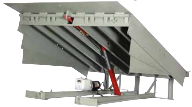
LHP Series 6' x 8' 25,000 CIR shown.

The lip is extended using a fixed but fully yieldable lip cylinder. Hydraulic lip activation provides added assurance of reliable lip extension even where debris or adverse weather conditions are prevalent. The LHP is a cost effective alternative for those considering mechanical or air powered levelers.