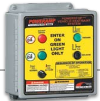
Dock Alert AAL Communication Package Shown