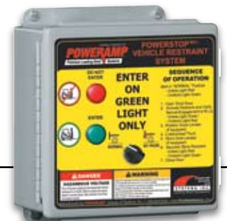
Dock Alert MAL Communication Package Shown