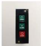
3 Button Station For external motor