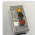
Nema-4 3 Button Station Waterproof plastic housing