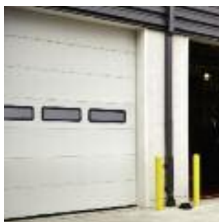
Insulated Lites allow for visibility while maintaining security