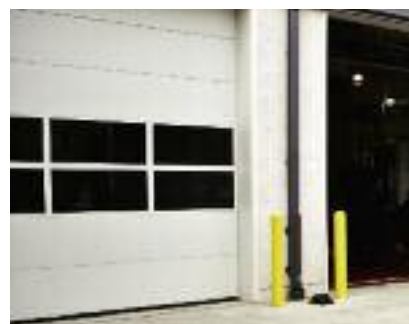
Full view sections allow for maximum natural light and visibility