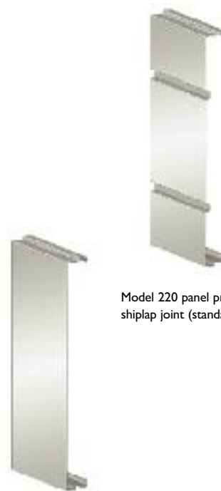
Model 220 panel profile with shiplap joint (standard).