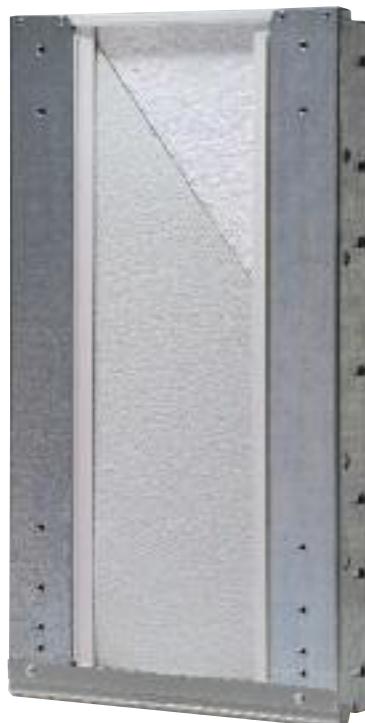
Optional polystyrene insulation sealed between door panel and embossed steel backing cuts heating/cooling cost.

Contact Wayne-Dalton for additional sizes and colors.